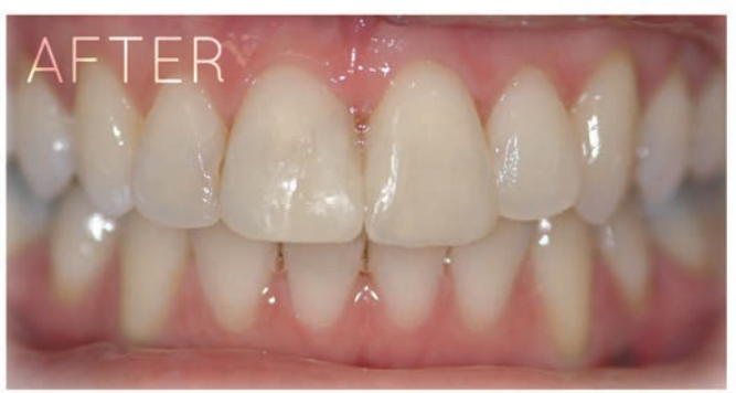
Severe crowding treated in just 6 months

On a routine visit to my dental practice, I happened to pick up a Cfast brochure. Four months later the braces were taken off and I have been walking around with a grin on my face ever since.